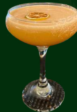
GRAPEFRUIT HONEY ROSEMARY MARGARITA $20

JAPANESE DRY GIN, PASSION FRUIT, ORANGE, PINEAPPLE, JASMIN TEA SYRUP, LIME