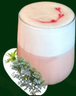
YEOJA LOVER $21

GIN, PIMM'S NO.1, WATERMELON, LIME, ELDER FLOWER, SODA