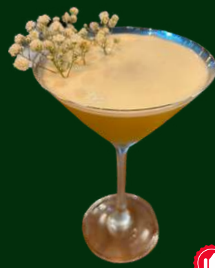
TROPICAL GARDEN $19

WHITE RUM, DARK RUM, COINTREAU, PINEAPPLE, ORANGE, LIME