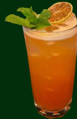
I'M NOT A MOJITO $20

2 OUNCES GIN 4 OUNCES TONIC WATER 2 LIME WHEELS