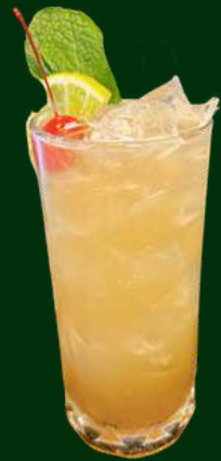
LONG ISLAND ICED TEA $20

VODKA, WHITE RUM, GIN, TEQUILA, CONTREAU, LIME, COCA COLA