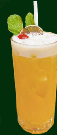
HOOK PUNCH $11.9

ORANGE JUICE PINEAPPLE JUICE LEMON & LIME JUICE GINGER ALE