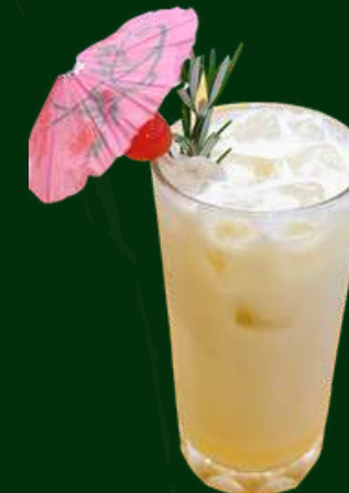
NAKED PINA COLADA $11.9

COCONUT MILK PINEAPPLE JUICE LEMON & LIME JUICE