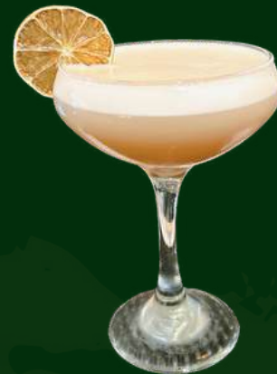
FRENCH MARTINI $18

BUTTERFLY PEA, GIN, BLUE CURACAO, ORANGE, YUZU, LIME