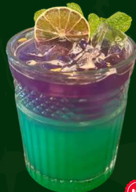
PHUKET ISLAND $20

SOJU VODKA, LYCHEE, ROSE, ELDER FLOWER, TIME, EGG WHITE