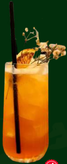
ROD LERT $20

GIN, PIMM'S NO.1, WATERMELON, LIME, ELDER FLOWER, SODA