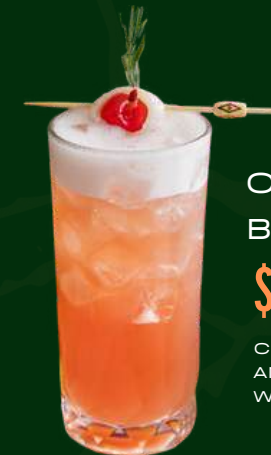
CUDDLE ON THE BEACH (PEACH OR LYCHEE) $11.9

CRANBERRY, GRAPEFRUIT, ORANGE AND LEMON JUICE WITH PEACH OR LYCHEE MONIN