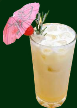
PINA COLADA $20

2 OUNCES GIN 4 OUNCES TONIC WATER 2 LIME WHEELS